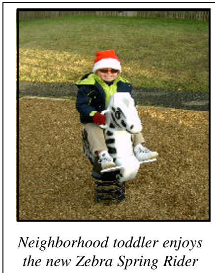
Neighborhood toddler enjoys the new Zebra Spring Rider

know that the tot lot has seen recent improvements. You will find a new Zebra spring rider and a set of seesaws. The seesaws replaced the tire swing, which had become rusted and would soon be dangerous for the children to play on. The board has ap-